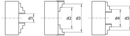
3-Jaw & 4-Jaw Scroll Chucks – Hard 2pc. Jaws – Series 32**, 35**, 36**, 37**