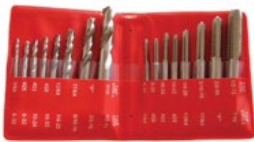
Fractional & Machine Screw