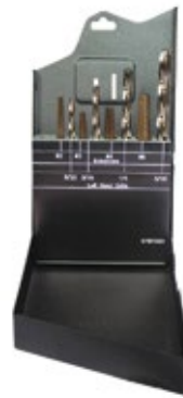
Square – 8 Pieces