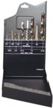
Spiral – 10 Pieces

Spiral & Square – Left Hand – Gold Finish