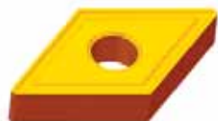
NEGATIVE 55° RHOMBIC