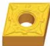
NEGATIVE 80° RHOMBIC