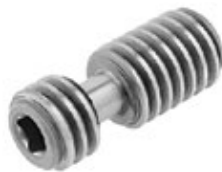
Operating Screws – 1 Piece