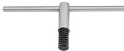
For 3-Jaw & 4-Jaw Chucks – 1 Piece