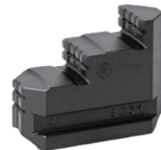
Hard Solid Reversible Jaws 1 Piece