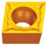
POSITIVE 80° RHOMBIC