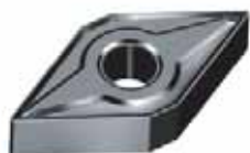
NEGATIVE 55° RHOMBIC