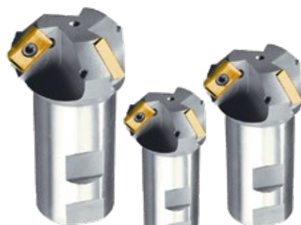
Sets include: 3 holders 10 APLT-347 inserts 1 wrench