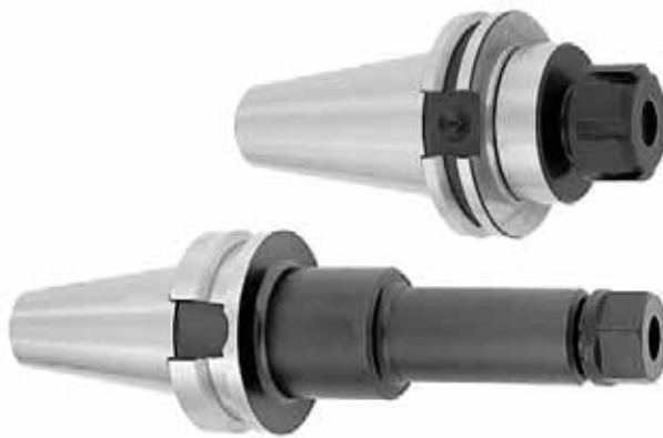
Groove of collet