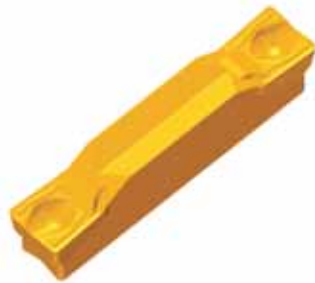
Double Cutting Edges