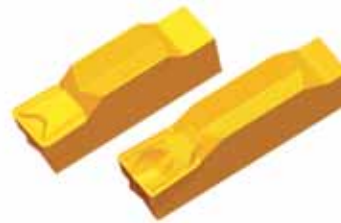
*Single Cutting Edge