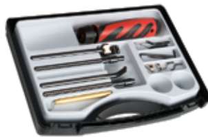
Classic Handle A