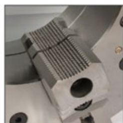
Heavy Duty Serrated Jaws