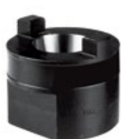
Fixed Vise Head