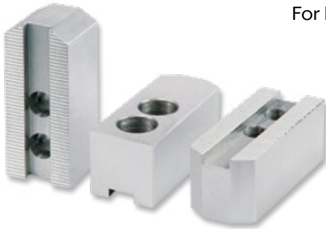
* Standard height