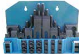
Table & Wall Mount